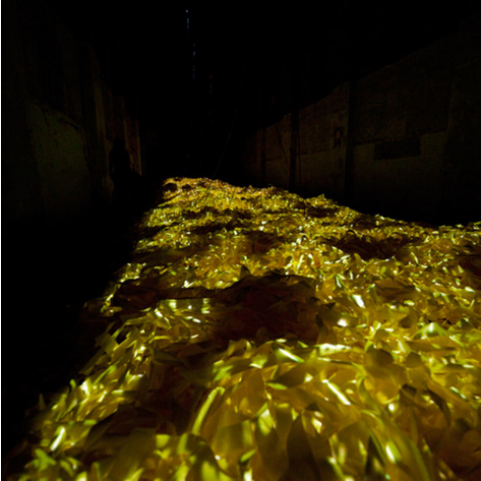
Installation View Credit: David Cotterrell (2011)