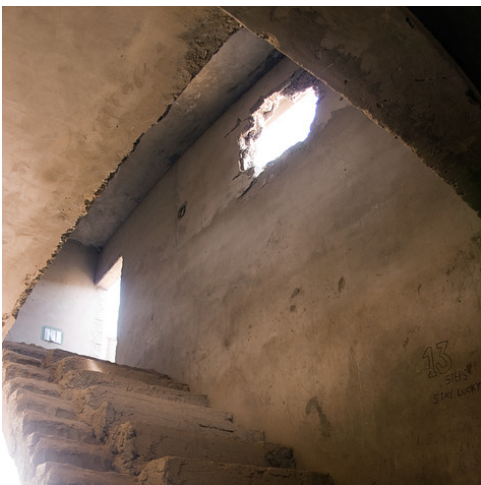
FOB Sangin