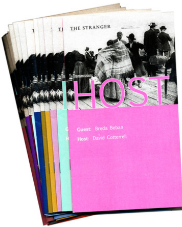
2009 Chapbook Edition Credit: Alan Rutherford (2009)