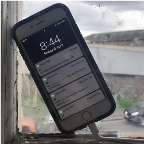
OnSilent at Safe House 1 Credit: © David Cotterrell (2018)