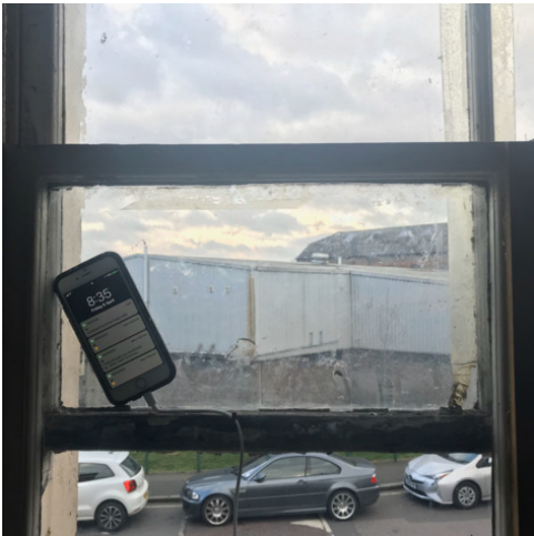
OnSilent at Safe House 1 Credit: © David Cotterrell (2018)