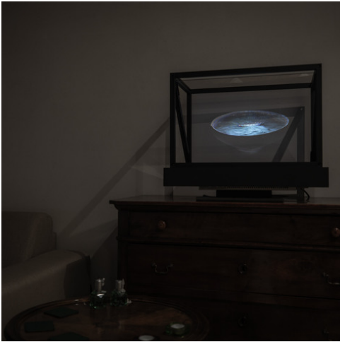
Wunderkammern - Envy Credit: © David Cotterrell (2024)