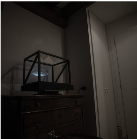
Wunderkammern - Envy